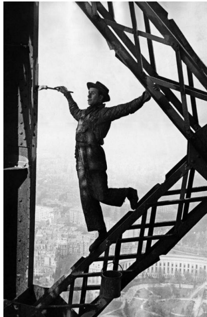
Fig. 2. The Painter of Eiffel Tower by Marc Riboud (1953).

Marc Riboud, born in 1923 in Saint-Genis-Laval in Lyon, took his first photographs in 1937 using a small vest pocket Kodak at the Exposition Universelle in Paris. In 1944, he joined the Resistance in the Vercors. From 1945 to 1948 he studied engineering at the École Centrale in Lyon and then started to work in a factory. Three years later he decided to become a photographer. The picture "The Painter on the Eiffel Tower" was his first publication in Life Magazine 1953. Invited by Henri Cartier-Bresson and Robert Capa, he joined Magnum Photos... Marc Riboud was 93 years old when he died in Paris on August 30, 2016. 2