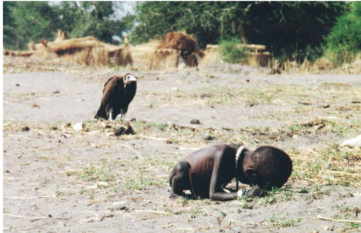
Fig. 3. The Child and Vulture by Kevin Carter (1993). https://www.boredpanda.com/top-100-world-photos-influential-all-time