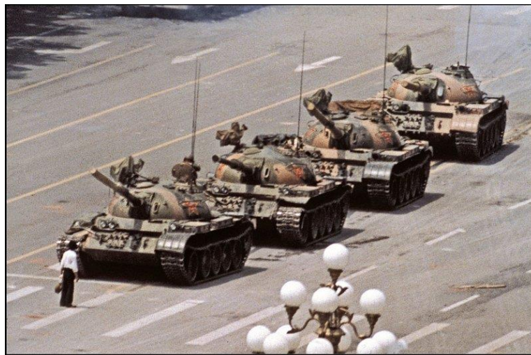
Fig. 4. Tank Man by Jeff Widener (1989). [Thanks to courtesy of Jeff Widener]. http://jeffwidener.com/stories/2016/09/tankman/

find out from the context what the subject of the photo is, may not be aware, at first, of the dramatic situation. This is because the compositional dominant of this image is again the rule of completeness with its static effect, which is achieved thanks to the presence of three planes (first, middle and background), giving the illusion of depth. This principle is broken up, but not enough to see the visual tension between a bloodthirsty bird and a little girl; neither of them has enough “visual mass”—they are similar in color and not very clearly (especially the head of the animal) cut off from the background. The little girl is visually larger than the predator, she is situated in the foreground, so she naturally attracts the eye. Perceptually, however, from the perspective of a purely external orientation in photography, we do not realize what is happening with the child. Horror is evoked only by cognitive attention (“docilem parare”)—understanding that we are dealing with a vulture and following its gaze, while we get shocked when we realize that a bird of prey is watching a small, exhausted girl. At this point we reinterpret the picture, grasping that she is at the end of her strength, because she is almost at the end of the picture frame having already covered a certain distance (from left to right). Meanwhile, the vulture (diagonally) is quite close to this child.