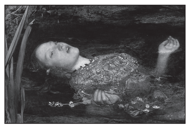
John Everett Millais, Ophelia, oil on canvas, Tate Britain, London 6

A daughter of the natural world as it was before the ecological balance was altered, in one early sequence recalled above, the youngest of the sisters approaches the elm-tree to place her hand on the plaster-filled circular shape, from where the bark had been removed. She leaves her imprint in the hollowed area, as if to preserve a percept of touch, besides other sensorial data perceived by passers-by, like smell, sight, and the sound of rustling