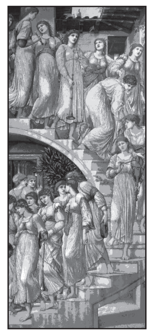
Sir Edward Coley Burne-Jones, \mathit{The \ Golden \ Stairs} , oil, Tate Gallery, London ^{10}