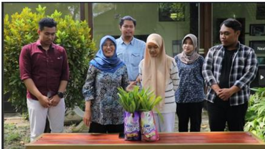
Figure 8. The production of ecobricks from plastic waste.

Students collect plastic waste from canteens, cut it into pieces, and arrange it in a specific pattern to create ecobricks. This process shows that student involvement as environmental volunteers can reduce waste and enhance the campus environment (Sunassee et al., 2021). The production of ecobricks is shown in Figure 8.