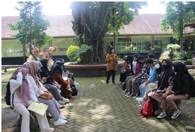
Figure 2. Giving instruction to students at the beginning of the learning

activities around the Universitas Negeri Malang campus areas. The model includes various waste management techniques such as eco-enzymes, ecobricks, briquettes, biomol, and compost production. It has been shown to positively impact students' attitudes towards environmental sustainability (Lestari et al., 2021). The method starts with educating students about waste management's importance and aims to instill a sense of responsibility for waste produced. This approach enhances student behavior identification by building fundamental knowledge on waste management (Molina & Catan, 2021). The initial activity is shown in Figure 2.