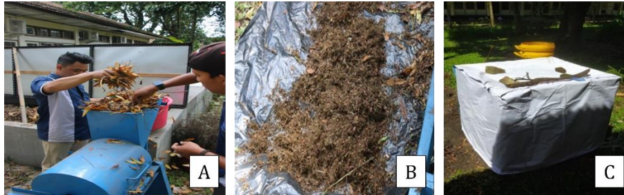
Figure 5. a) decomposition of leaf waste with a grinding machine, b) refined organic waste, and c) compost fermentation boxes to accelerate decomposition

Organic fertilizer is a nutrient source for plants derived from organic substances, including plant wastes, animal feces and other organic components (Shaji et al., 2021). Organic fertilizer is created via a process of natural decomposition facilitated by microorganisms like bacteria and earthworms. These microorganisms turn the fertilizer into nutrients that can be readily absorbed up by plants (Roidah, 2013; Sayara et al., 2020). Prior study has revealed that organic fertilizer plays a significant role in environmental conservation by utilizing organic waste as a fundamental component for its production (Bahri et al., 2022). An important benefit of organic fertilizer is its ability to enhance soil structure and promote soil microbial activity, leading to improved soil fertility (Zhou et al., 2022). In addition, organic fertilizer has the capability to reduce soil erosion, enhance water retention, and minimize use on chemical fertilizers that can have negative impacts on the environment (Assefa, 2019). Further, the processing of organic waste into ready-to-use compost can be seen in Figure 6.