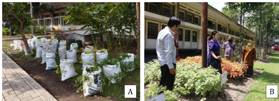
Figure 7. a) Applying fertilizer to sweet potatoes ( Ipomoea batatas L), b) fertilizing herbal plants.

Leaf litter was quickly incorporated into a soil excavation, resulting in coarse compost after one month. In the second experiment, the collected leaf waste was ground with a machine and treated with a solution of EM4 or biomol from previous fermentation. The modified storage box accelerated decomposition, producing quicker and more uniform compost used as organic fertilizer for campus plants. This approach also supports recycling efforts and reduces the need to purchase additional compost for campus surroundings.