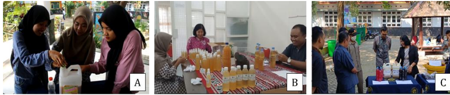
Figure 4. a) producing biomol, b) packing eco-enzym, c) presenting in school exhibition.

month in jerry cans. The results of the biomol fermentation processes will be used as an activator for composting decomposition, allowing for the production of compost much more quickly. The process of producing and packing eco-enzymes can be seen in Figure 4.