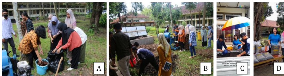
Figure 6. a) sorting organic waste materials, b) separating organic waste materials, c) Harvesting compost, d) Packing compost.

Organic fertilizer is a nutrient source for plants derived from organic substances, including plant wastes, animal feces and other organic components (Shaji et al., 2021). Organic fertilizer is created via a process of natural decomposition facilitated by microorganisms like bacteria and earthworms. These microorganisms turn the fertilizer into nutrients that can be readily absorbed up by plants (Roidah, 2013; Sayara et al., 2020). Prior study has revealed that organic fertilizer plays a significant role in environmental conservation by utilizing organic waste as a fundamental component for its production (Bahri et al., 2022). An important benefit of organic fertilizer is its ability to enhance soil structure and promote soil microbial activity, leading to improved soil fertility (Zhou et al., 2022). In addition, organic fertilizer has the capability to reduce soil erosion, enhance water retention, and minimize use on chemical fertilizers that can have negative impacts on the environment (Assefa, 2019). Further, the processing of organic waste into ready-to-use compost can be seen in Figure 6.