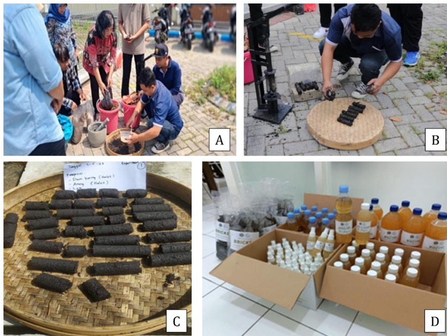
Figure 9. A) Processing organic waste, B) printing briquette, C) making sun-dried briquettes, D) packing briquette.

to create a solid fuel (Kumar et al., 2021). They can be used as an alternative to wood or coal for industry and household use (MS et al., 2020), serving as an eco-friendly energy source with benefits including efficient combustion, practical transportation and storage, and the ability to be recycled from organic waste or biomass. The process includes crushing the collected waste into smaller pieces for processing with other materials before being combined with a binding agent (Haryanti et al., 2021; Marreiro et al., 2021), consisting of ash powder left over from burning, sawdust and coconut shells (Handayani et al., 2023). This mixture is then compressed using a press machine and dried using methods such as sunlight or dryers before they can be used as an alternative fuel for cooking or heating. The process of producing briquette is shown in Figure 9.