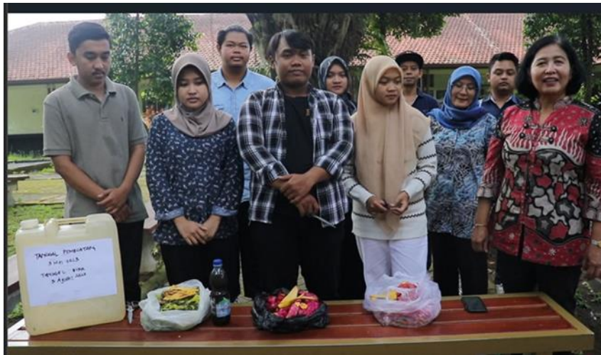
Figure 3. Eco-enzyme production from organic waste.

study has revealed that the utilization of biomol positively impacts the growth of sweet potato plants (Shaji et al., 2021). The use of biomol as a liquid organic fertilizer has an impact on the growth of corn plants. In addition, the utilization of Biomol liquid in the production of compost fertilizer might enhance the rate of decomposition of organic waste.